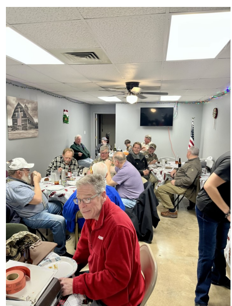
Members enjoying themselves.

the gift table that night, his numbers kept on getting drawn!